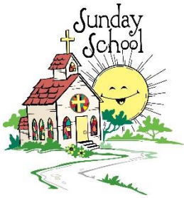
Sunday School Volunteers

Please consider becoming a Sunday School Volunteer!